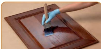
PROTECTIVE TOP COAT